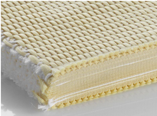
Multilayer Aramid